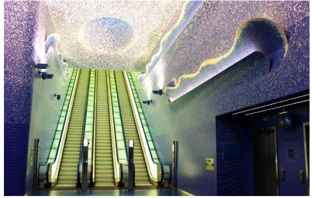
Toledo Station, Naples Underground Line 1 – Italy