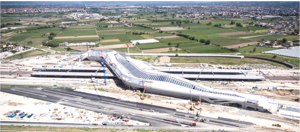
Naples-Afragola High-Speed Railway Station – Italy.