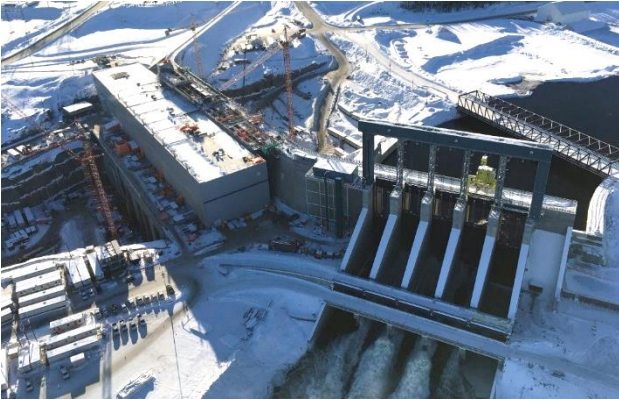
Muskrat Falls Hydroelectric Project – Canada.