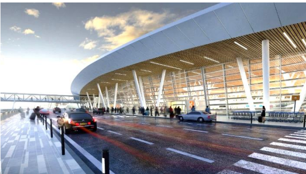
Arturo Merino Benítez Airport in Santiago de Chile – Chile.